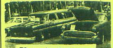
Sherwin & Mikes Vehicles