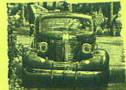
Irving & Irene's Pontiac